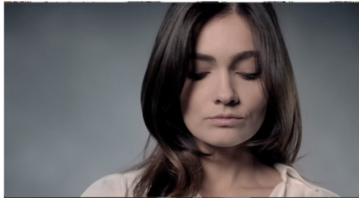
Figure A4. Beginning of the spot.