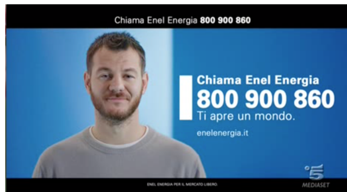
Figure A3. Final section of the spot.