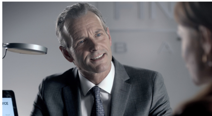
Figure A5. Central section of the spot.