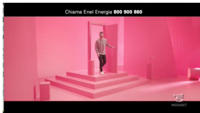
Figure A1. Beginning of the spot.

Call Energy Enel, it will make you discover a new world".