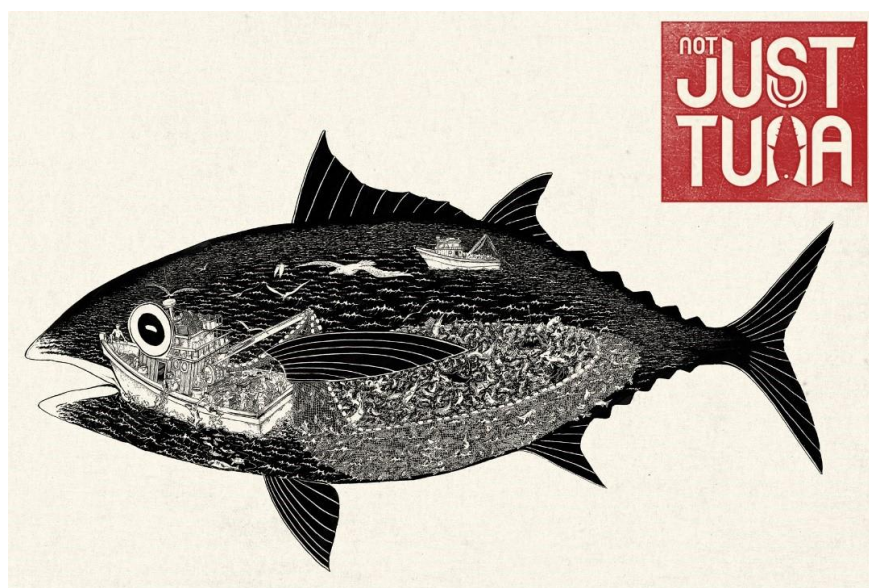
Fig. 4: Visual argument in the tuna campaign (version 1)