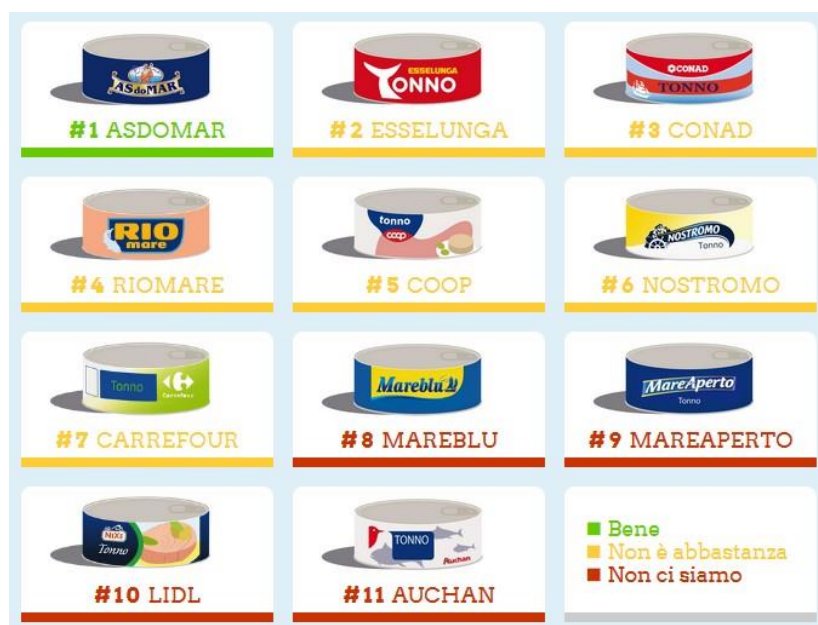
Fig. 3: Company ranking in the Italian Guide

As regards the verbs ‘rank’ and ‘assess’ (‘valutare’ in the Italian text), from a pragmatic point of view they are functional to presenting the subject and arguer (i.e. Greenpeace) as an expert and a moral authority, in charge of assessing tuna brands and judging their conduct. Moreover, the verbs in question serve to introduce and anticipate the content of the guides, i.e. the appraisal of brands, because the results of the investigations carried out by Greenpeace on corporate performances (to be found below the introductory lines) are reduced to rankings, whereby the companies are listed from the most to the least sustainable. As figure 3 shows, the brand names are flanked on the left by numbers specifying their positions in the ranking. The challenging resolution of the tuna crisis is, therefore, discursively constructed as a competition, in which tuna brands vie for greenness. Figure 3 displays the ranking of the Italian guide, which also exemplifies the American.